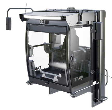
Spaceous cabin with excellent visibility for operational safety & efficiency.