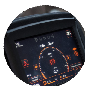
High resolution color touch screen for easy operation.